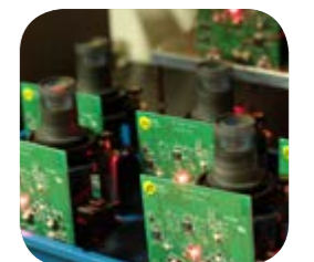
Rotating Head Endurance Test